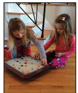
My girls are still a little bit too young to enjoy (un)Scrabble, but they sure do enjoy pretending to play the game!