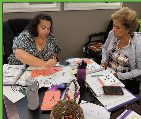
Trainees learning and role playing to practice important components of the Orton-Gillingham lesson plan.