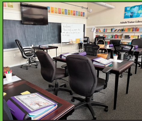
The center was prepared and ready for a new group of trainees.