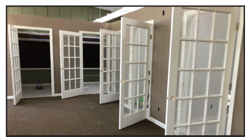
The tutoring center is almost done being painted, but is already being used 6 days a week by the 12 children in our program!

We are now in the thick of preparing for our grand opening celebration, and you will see invitations in your mailbox very soon. Until then, please hold the date in your calendar: Sunday, November 4th at 12pm, for a formal ribbon cutting followed by tours of the building, lunch, and a keynote speaker. Many of us will be coming that day straight from the Dyslexia Dash in Eisenhower Park (see page 4 for details). continued on p.2