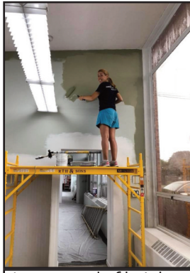
I am scared of heights. Every day, we face fears that challenge us to become better verions of ourselves. Fear is a great motivator!

I wish the same premise held true in adult life. I wish someone would hold my hand, encourage me, and praise me every time I had to face something scary - but unfortunately, that is not reality. As adults, we all have to do things that scare us: consider the students who move across the globe for just the chance at a better life. (We're moving our building three towns over and I'm scared, imagine how they feel?) It is a nice reminder that as tutors and teachers, we should practice patience with our students and be cognizant to offer encouraging words as often as possible. They really can go a long way.