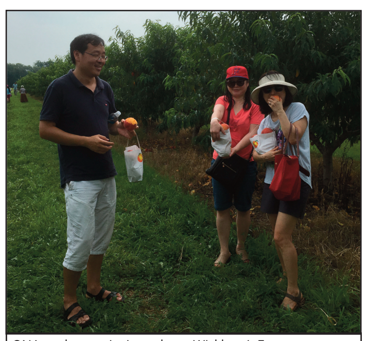
ONA students enjoying a day at Wickham's Farm.