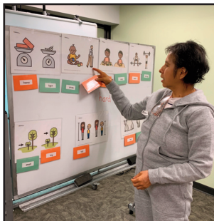
We use all of the great resources at the library.

A few lessons ago, students were learning about community maps and directional words. I found a YouTube video by an artist demonstrating how to draw a community map. Each student was given an 11x11 sheet of paper, and together, following the visual and oral instructions, they created their own community maps complete with a map key and color. The students were listening to directions in English while simultaneously following step-by-step instructions to draw their maps. The results were wonderful, and the students were incredibly proud of their work.