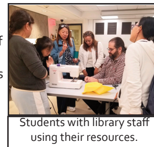
Students with library staff using their resources.

We are lucky to be at libraries with so much to offer. There is technology, including digital whiteboards, which allow the students interactive learning experiences. There are also digital resources with the Ventures program. The libraries graciously provided the students with tours of their buildings, including what materials, resources, and programs are available to them. We had a lesson on how to sign-up for programs, and one of the library directors even came to our class to