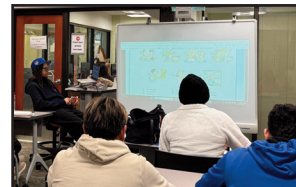
Our Freeport Library students using the smartboard for their English lessons.