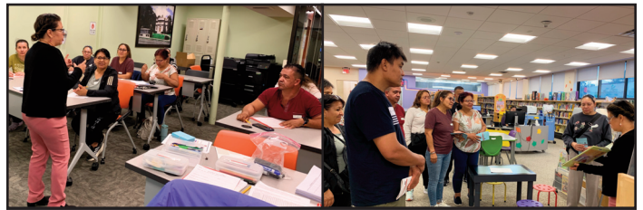
The Freeport Memorial Library has always been a great partner and always welcoming to our students. They host five of our ESL classes.

In just a few short months, from September to January, it has been wonderful to see how my students have formed friendships. They share rides to and from the library, exchange phone numbers, and notify me when someone will be absent. We talk about our families, jobs, and current world events. Many students were especially engaged in discussions about what is happening in Venezuela, as several have family members living there. Their perspectives added depth and meaning to our conversations.