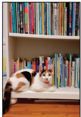
Our kitten, Cici, is learning to be a literary kitty by resting on bookshelves throughout our house!

Better days are coming! Until then, stay vigilant, safe, and healthy.