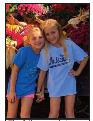
The fall season brings a cacophony of colors, a blur of activity, and a myriad of reasons to be grateful.

However, there's a second reason for my commitment to the Literacy Nassau mission: it honors my own family's legacy. My parents were immigrants. They were Holocaust survivors, who arrived in New York jobless, unable to speak or read English. They were helped by social service organizations that housed and counseled them. They both worked in garment sweatshops (continued on p. 3)