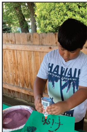
Using glue and sand art to create words.