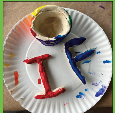
Forming letters and words with clay is an example of a multisensory approach to OG.