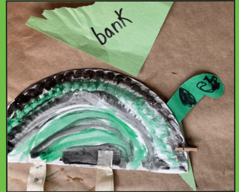
Dinosaur eating words with the syllable types we learned.