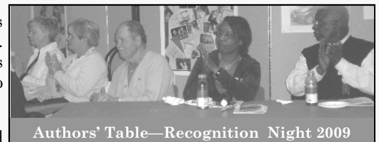
Authors' Table—Recognition Night 2009

Categories included Basic Literacy Student of the Year, ESOL Student of the Year, Volunteer of the Year, and Tutor of the Year. As recipients accepted their well-deserved awards, I was moved by their personal stories of courage, challenges, determination and dreams come true. Students beamed as they told of earning a GED, becoming a citizen, or reading a newspaper for the first time. Tutors described the gratifying rewards of sharing their time and talents. How could I resist? I signed up for tutor training soon after!